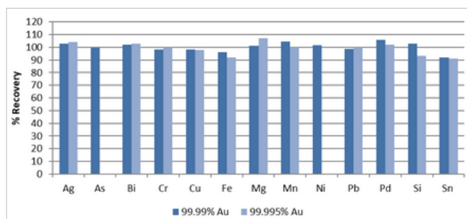
Figure 1. Analyte spike recoveries in 1% Au at the 99.99% (dark blue) and 99.995% (light blue) impurity specification levels.

For accuracy determination, 1% gold solutions were spiked at the specification levels for 99.99% and 99.995% gold and measured against external calibration curves. Figure 1 shows the spike recoveries at both specification levels. With all recoveries within 10%, accuracy is shown, demonstrating that with the proper selection of wavelengths and analytical conditions, a 1% gold matrix does not inhibit impurity analysis.